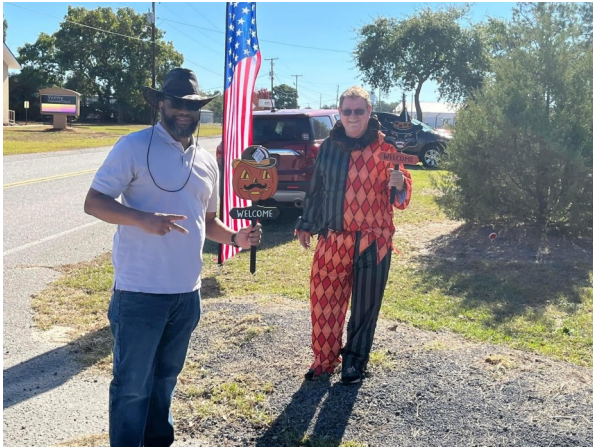
District Commander and Department Adj welcoming Committee.