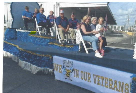
Veterans Day Parade 2022

10624 has been busy this year. On December 10th we held our annual fund raiser for the Fisher house and on January 13th for the National Home